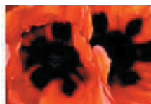
Oriental Poppies, Georgia O'Keeffe, 1928

The Frederick R. Weisman Art Museum at the University of Minnesota in Minneapolis, Minnesota, sits on the banks of the Mississippi River. Founded in 1934, it moved to a new facility, designed by architect Frank O. Gehry in 1993. The Weisman was the first art museum designed from by Gehry, who became famous world-wide after his second museum, the Guggenheim Museum in Bilbao, Spain. The museum's collection of about 20,000 objects includes paintings, photography, graphics, sculpture, furniture, and ceramics. The painting collection is strongest in American art. The