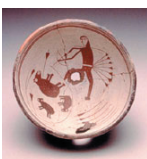
Bowl, Mimbres, c. 1000

The Weisman's visitors of about 150,000 annually come half from the University and half from the community. An interdis-