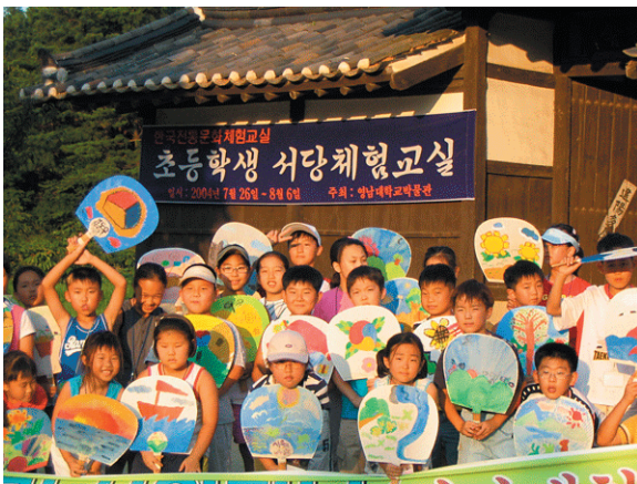
Kids education program at Yeungnam University Museum