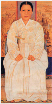
Portrait of a Woman, Modern Era, Hangyang University Museum

UMAC Seoul 2004 was a strong conference: the many presentations were of good standard; the speakers came from many countries and backgrounds; the experiences were rich; and the organization and hospitality of our many Korean hosts were the crowning glories