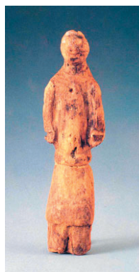
Wooden Statue, Unified Silla Era, Hanyang University Museum, Seoul

The 2004 UMAC formal presentations had been organised so as to give an equal time for discussion, each day starting with one or two lead papers. Nearly all the audience participated in the discussions, interesting points were raised, participants grew to understand each other and so it is strongly recommended that this formula be followed in future conferences.