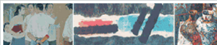
Contemporary Art from the collection of Seoul National University Museum