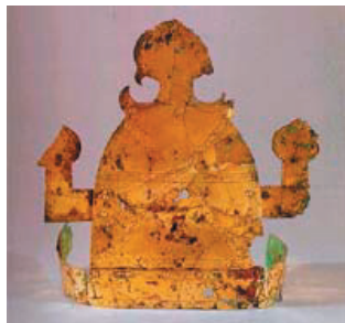
Gilt-bronze crown, Gaya Age, Keimyung University Museum