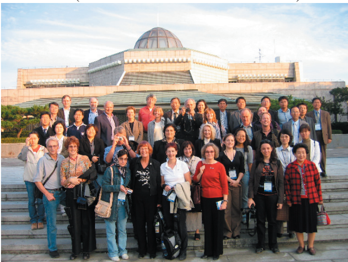
UMAC members at the University Museum of Yeungnam University, Gyeongsan, 350 km. Southeast of Seoul.