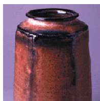
Vase, Warren MacKenzie, 20th century